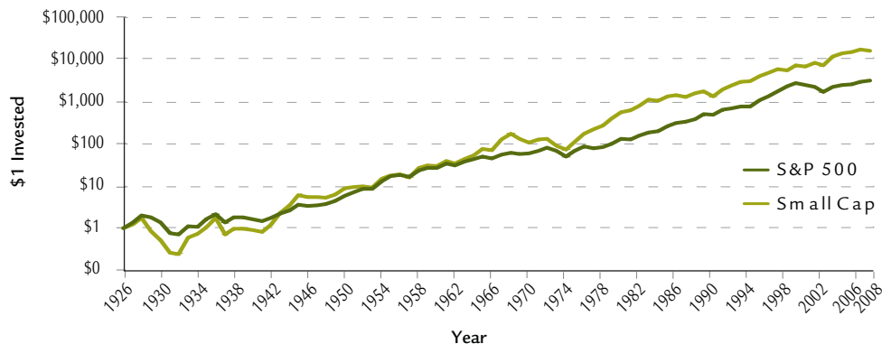
Exhibit 7: Cumulative Returns, Small Cap vs. Large Cap, 1926 - 2008*

Source: Ibbotson via Morningstar, S&P via FactSet (data as of 12/31/08). Past performance is not a guarantee of future results.