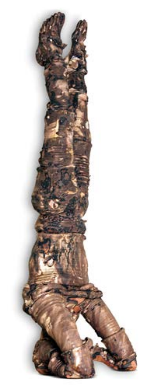
Standing Figure —Duane Brant

COMMITMENT TO OUR CLIENTS. CONVICTION IN OUR STRATEGIES.