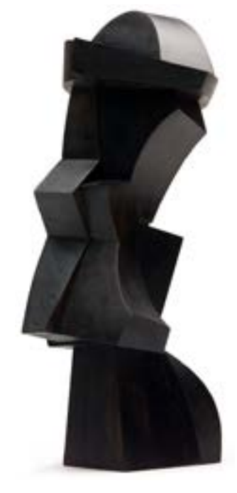
Negresse —Peter Ambrose

BRANDES' SINGULAR FOCUS ON VALUE INVESTING ENABLES US TO SERVE A VARIETY OF INVESTORS.