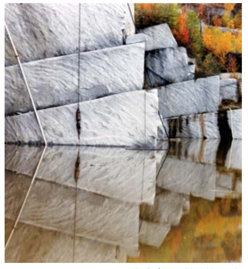
Rock of Ages-Edward Burtynsky

Guided by the principles of Benjamin Graham, widely considered the father of value investing, we seek to take advantage of market irrationality and short-term security mispricing by buying stocks and bonds that we believe are underpriced based on our estimates of their true worth.